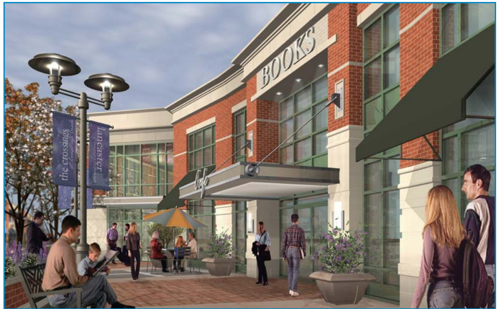
The Crossings at Conestoga Creek will provide a unique experience combining shopping, dining, and entertainment elements in a fun, pedestrian-friendly, open-air setting.