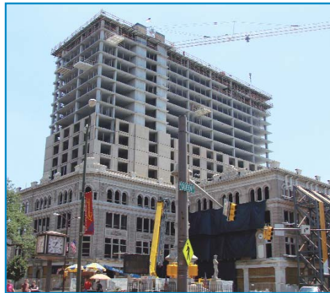
The Marriott Lancaster at Penn Square features the site's original 19th-Century, Beaux Arts-style façade — that of the former Watt & Shand department store — which is being preserved as one of Lancaster's most recognized icons of a diverse architectural heritage.